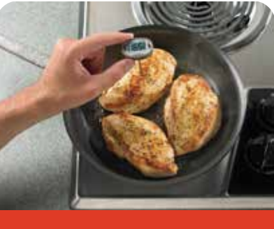
Check with a Food Thermometer